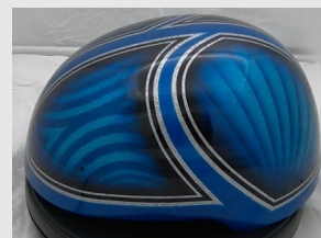
BOMBHELL DELUXE Deluxe Kustom Paint 3rd Place