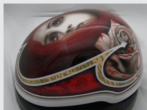
SHANNON BEST Best Built Customs 2nd Place